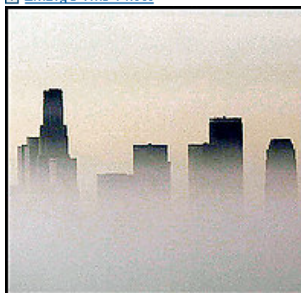
For pollution, Los Angeles is No. 1.