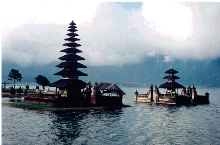
FIGURE 1. (a) Top: Hierarchy of nested water temples at different water diversion points in a small portion of the Petanu River, Bali (adapted from ref 12). Subaks are local level irrigation associations containing an average of 92 small individual farms that control water from a single dam or weir. (b) Bottom: At the highest organizational level is the Crater Lake temple.

(10–12). Freshwater is in limited supply in Bali, flowing from a central location through natural and man-made irrigation channels to terraced rice farms. This water flow is governed by small water temples at individual farms, progressing through local irrigation associations, called subaks , that manage individual dams and weirs to the highest-level temple at the water source (see Figure 1).