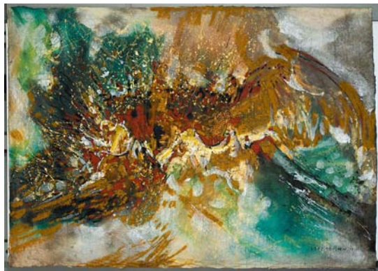
Jae-Im Kim: Divine Mystery IV, 1995, 52" X 73", mixed media on paper.

www.yale.edu/ism/events/LiturgyMigration