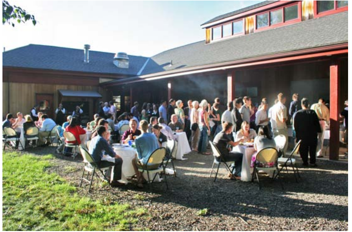
The ISM picnic

All the students, faculty, and staff of the Institute celebrated the opening of the academic year at the ISM picnic, held again this year on the grounds of the Eli Whitney Museum in Hamden.