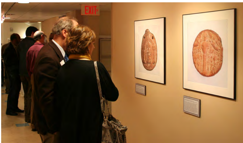
The conference Looking East: A Window on the Eastern Christian Traditions of Epiphany was held in November in conjunction with the exhibition. Here conference visitors engage with the art and architecture.