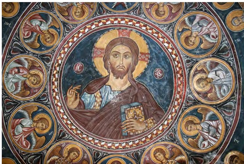
Pantokrator, Byzantine Church, Panagia Phorbiotissa, Asinou, Cyprus, 14 th c. Fresco.

The exhibition is open weekdays from 9 – 4 (except holidays; also closed Dec. 22 – Jan. 2).