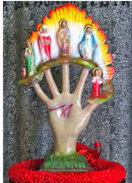
The Powerful Hand , chalkware devotional object, 2010.

international, interdisciplinary. It is equally about the “stuff” of religious practice and about multiplying ways of being in conversation, of sharing information and producing knowledge, about this set of subjects.