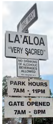
Signage at La'Aloa, Big Island, Hawaii, April 2011.

The Initiative imagines numerous arenas of activity, in real and virtual spaces. It shapes an interdisciplinary scholarly center for religion and visual/material culture studies at Yale University. From this local base in New Haven, it aims to facilitate a network of institutional and individual collaborators and imagines many partners in this work. In implementing this Initiative, we intend multiple audiences in varied settings, including higher education, religious community, arts and architectural professions, museums, and civic life, and we invite interaction with and among them.