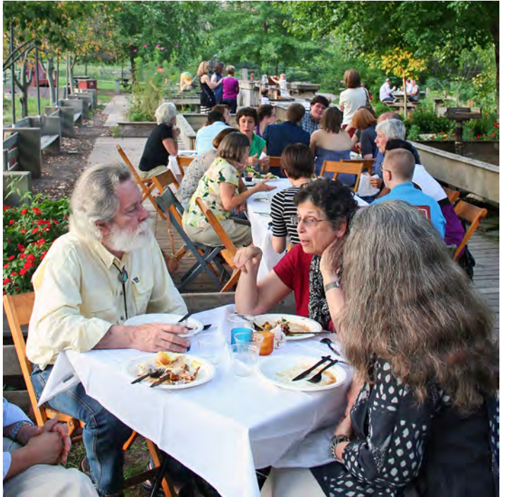
Breaking bread al fresco .

The ISM community celebrated the opening of the academic year at the ISM picnic, held again this year on the grounds of the Eli Whitney Museum in Hamden.