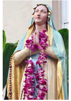
Our Lady of Lourdes, Lahaina, Maui, May 2011.

The subjects of the three thematic conference sessions are: "Possessions," including spirit possession, self-possession, and material possessions; "Transgressions," including transgressions of/by objects, people, and/or spaces; and "Transformations," concerning material, spiritual, spatial metamorphoses. Conversational panels take up the subjects of "Devotional Bodies"; "Iconoclastic Objects"; and "Contested Grounds." "Devotional Bodies" focuses on an intersecting constellation of issues including ideas of embodiment, materiality, devotional/religious practice, sensory hierarchies, and cultural constructions of race and gender. "Iconoclastic Objects" engages sensory contentions more directly, examining objects that have, for a variety of reasons, elicited controversy and hostility among specific groups of people. "Contested Grounds" turns to spatial considerations of places, boundaries, barriers, bridges, and, in each case, especially those spaces considered sacred. Here the geographical or categorical movement of objects into specific conceptual, architectural, civic, or environmental spaces will also shape subjects.