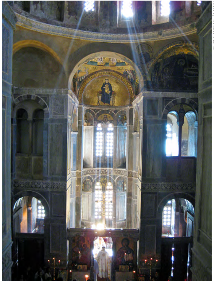
11 th century Orthodox Church.

These are some of the issues that will be explored Nov. 10 – 11 in a multidisciplinary conference Looking East: A Window on the Eastern Christian Traditions of Epiphany hosted by the Yale Institute of Sacred Music with support from the Ockeghem Foundation. Geared for an informed general audience as well as those with a scholarly interest in the subject, the conference will offer separate sessions on musical, liturgical, and artistic/architectural perspectives, a discussion with practitioners from local Orthodox congregations, Orthodox worship in Marquand Chapel, and a talk on teaching Coptic