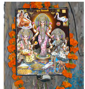
Lakshmi Tree Shrine, Delhi, India, March 2010.

In its founding years and first program cycle, the Initiative is generously supported by the Henry Luce Foundation, the Yale Institute of Sacred Music (ISM), and Yale University.