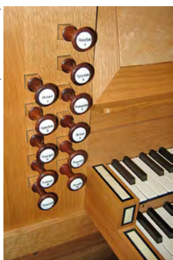
Above: The left jamb Below: The Pasi organ is delivered.