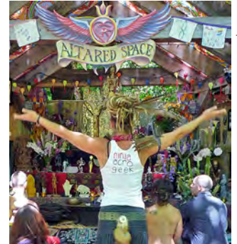
Altared Space, Oregon County Fair, July 2011.

"Sensational Religion" is sponsored by the Initiative for the Study of Material and Visual Cultures of Religion with the Yale Institute of