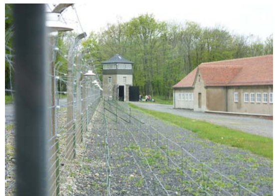
View from the interior of the barbed wire fence at Buchenwald.

On our last day in Weimar, we went to the site of the former concentration camp of Buchenwald, now a memorial to the victims who perished there. As we went through the remnants of cells, barracks, execution chambers, and the crematorium, the horror of the Holocaust became overwhelmingly real in a way that I hadn’t been prepared for. One of the things I noticed as we went through the gates of the camp was the incredible view of the valley below, with its endless fields of yellow rapeseed flower. It seemed surreal – almost a cruel mockery – that as prisoners entered the gates, they would have seen a similar glimpse of beauty, all the while trapped in a hellish existence from which there was no escape.