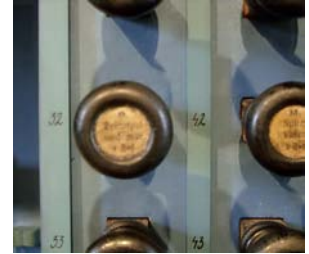
Stop knobs on the organ in Naumburg, which Bach helped to design and himself played.

It was the experience of encountering this exceeding beauty, whether it was the craftsmanship of exquisite pipe organs, the lavish church architecture, or the incredible museums and former palaces of the Bavarian nobility, that made the experience of extreme ugliness at one of our stops so difficult to understand.