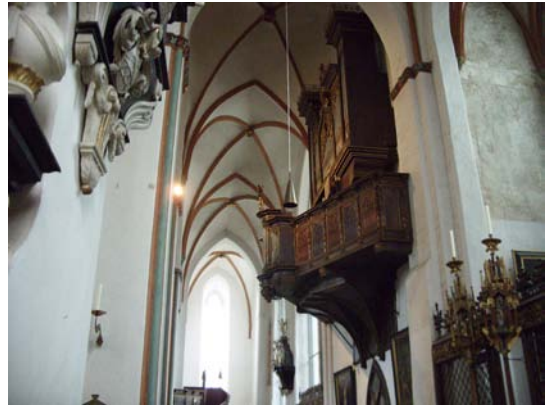
Stollwagen organ in St. Jacobi Kirche in Lübeck.