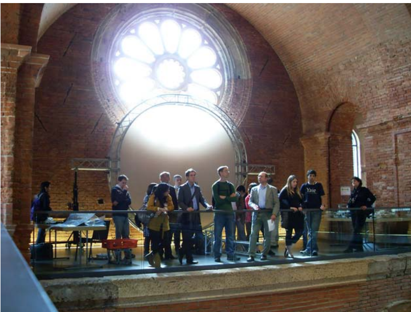
Students at Allerheiligen-Hofkirche, Munich Residenzplatz.