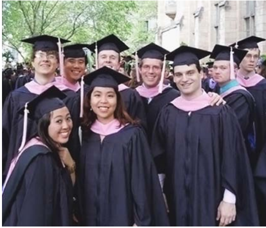
Some of the music graduates