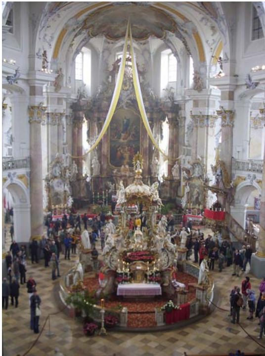
Tourists and pilgrims after Ascension Day mass at Basilika Vierzehnheiligen.

that they had the quality and timbre of sackbuts (the predecessor of the modern trombone). At that moment I wondered how people had gotten it so wrong in the 1950s and 60s: at that time, beautiful pipe organs from the turn of the century were ripped out and replaced with ones which were supposedly modeled on principles of North German organ building, but often characterized by weaker foundation tone and bright, oftentimes shrill mixtures. The tone quality of the aforementioned principal stops was incredibly full and vocal, and the warmth of their sound was enough to make me forget about the chill of the unheated church building.