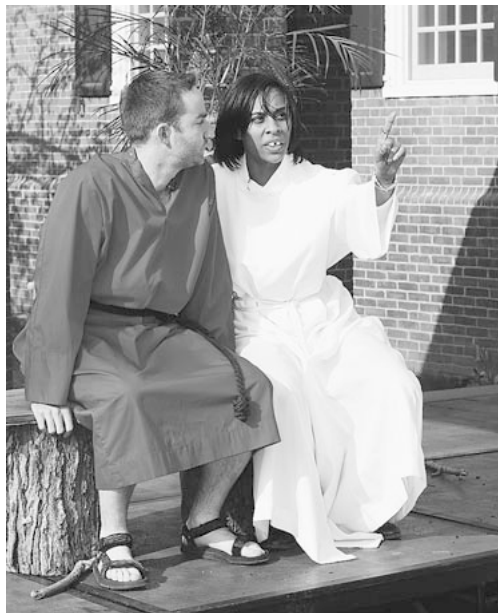
Cain and Abel in happier times.