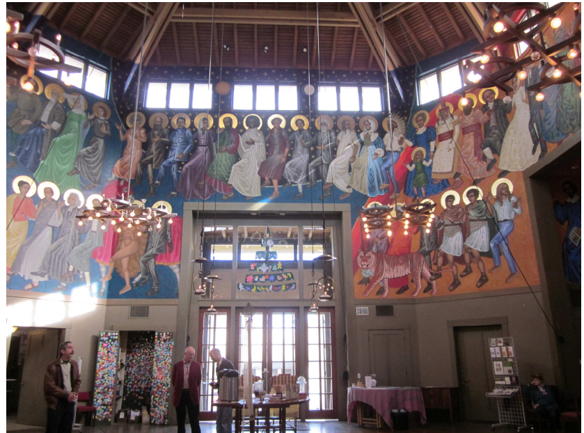
The Altar in the rotunda at St. Gregory's, surrounded by the dancing saints.

Gregory, bishop of Nyssa, is one of the so-named Cappadocian Fathers along with his brother Basil of Caesarea and his friend Gregory Nazianzus. The three theologians were instrumental in constructing