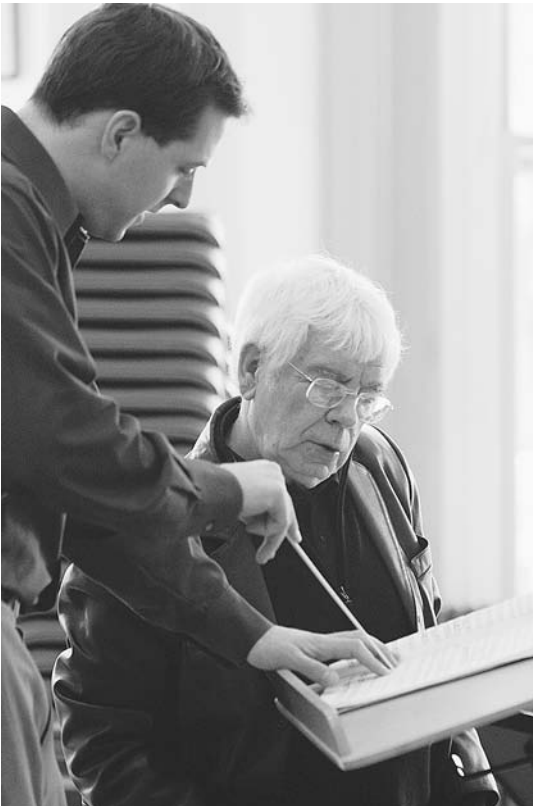
Helmuth Rilling works with a student during his January 2006 residency at Yale