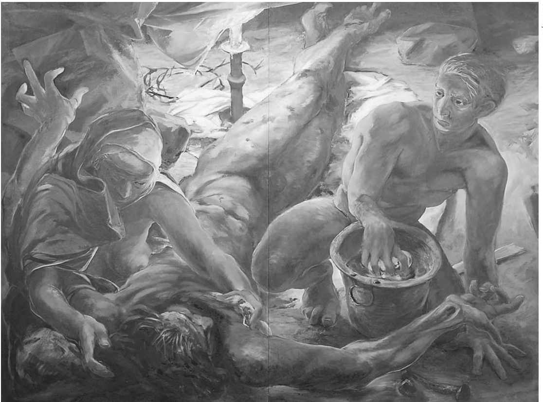
Below: Ed Knippers, Pietà , 72" x 96", Oil on panel

This exhibition will be on display weekdays 9 – 4 from March 3 – 28 at the Institute, with a reception on Thursday, March 6 at 4:30 pm in the Great Hall.