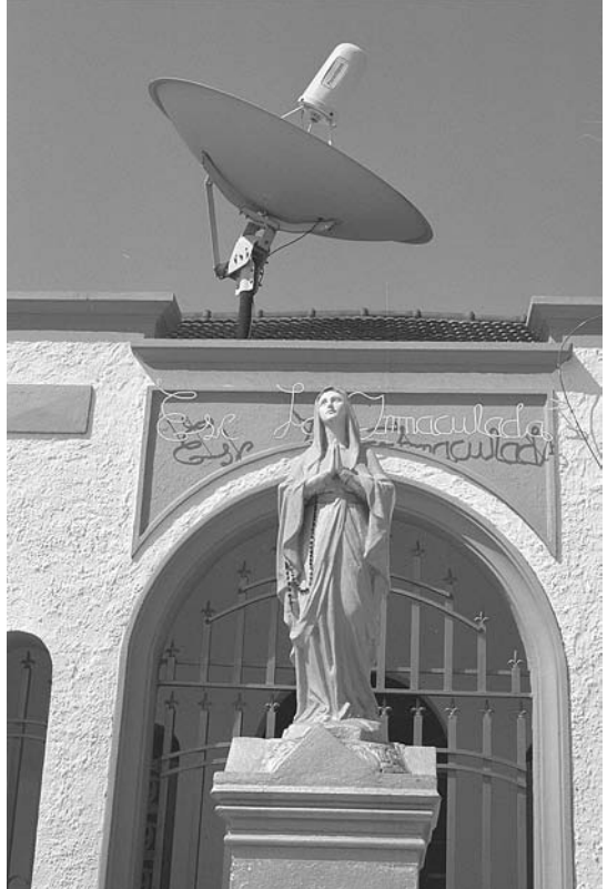
Above: Kathy Hettinga, Immaculada Columbia , 28" x 21" Digital print on German etching paper, 2006