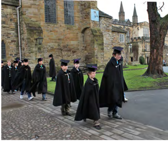
The ancient monastic foundation still bustles with activity. Choristers processing back to school following rehearsal in the Cathedral.