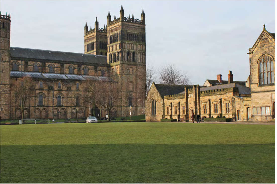
The Cathedral and neighboring Durham University Department of Music viewed from Palace Green.