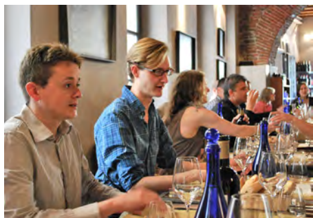
Schola Italian Style.