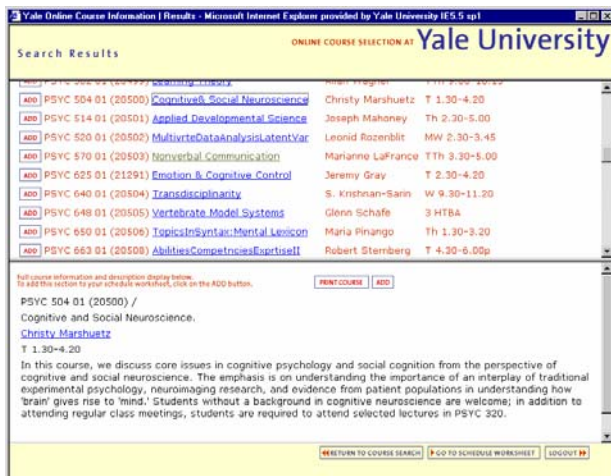
The Search Results page